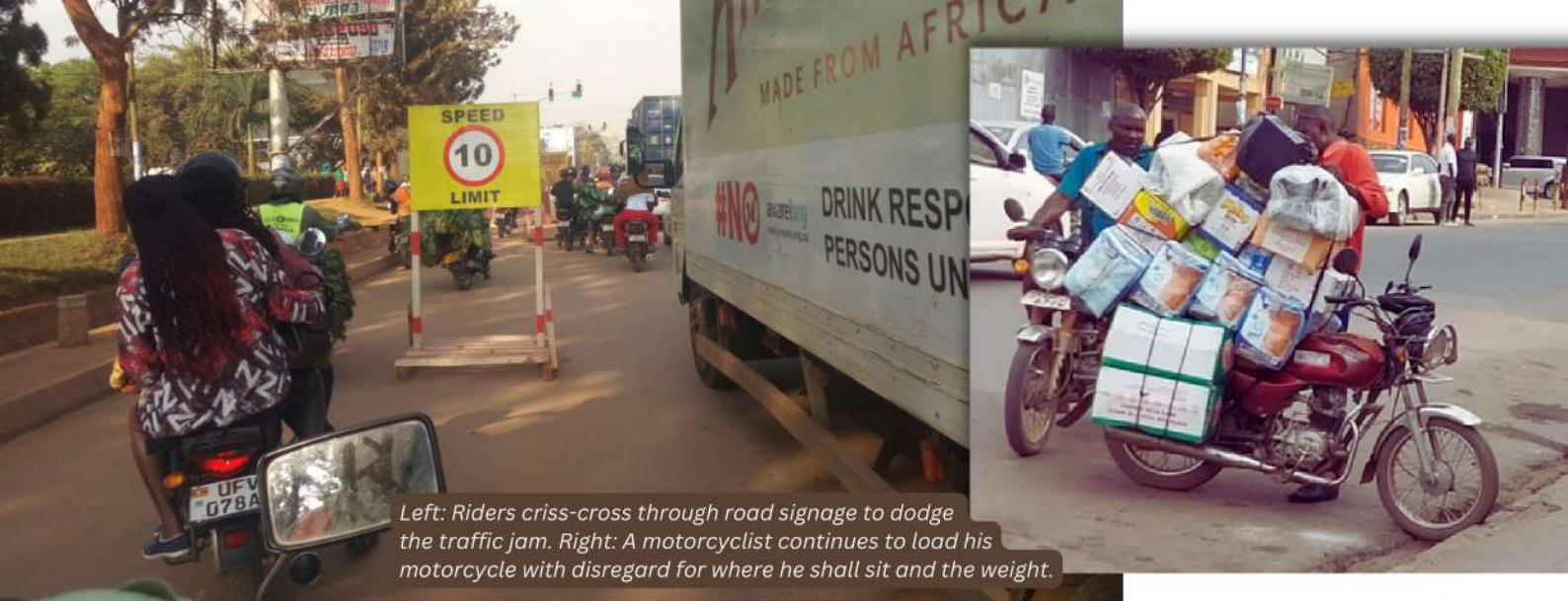
Left: Riders criss-cross through road signage to dodge the traffic jam. Right: A motorcyclist continues to load his motorcycle with disregard for where he shall sit and the weight.