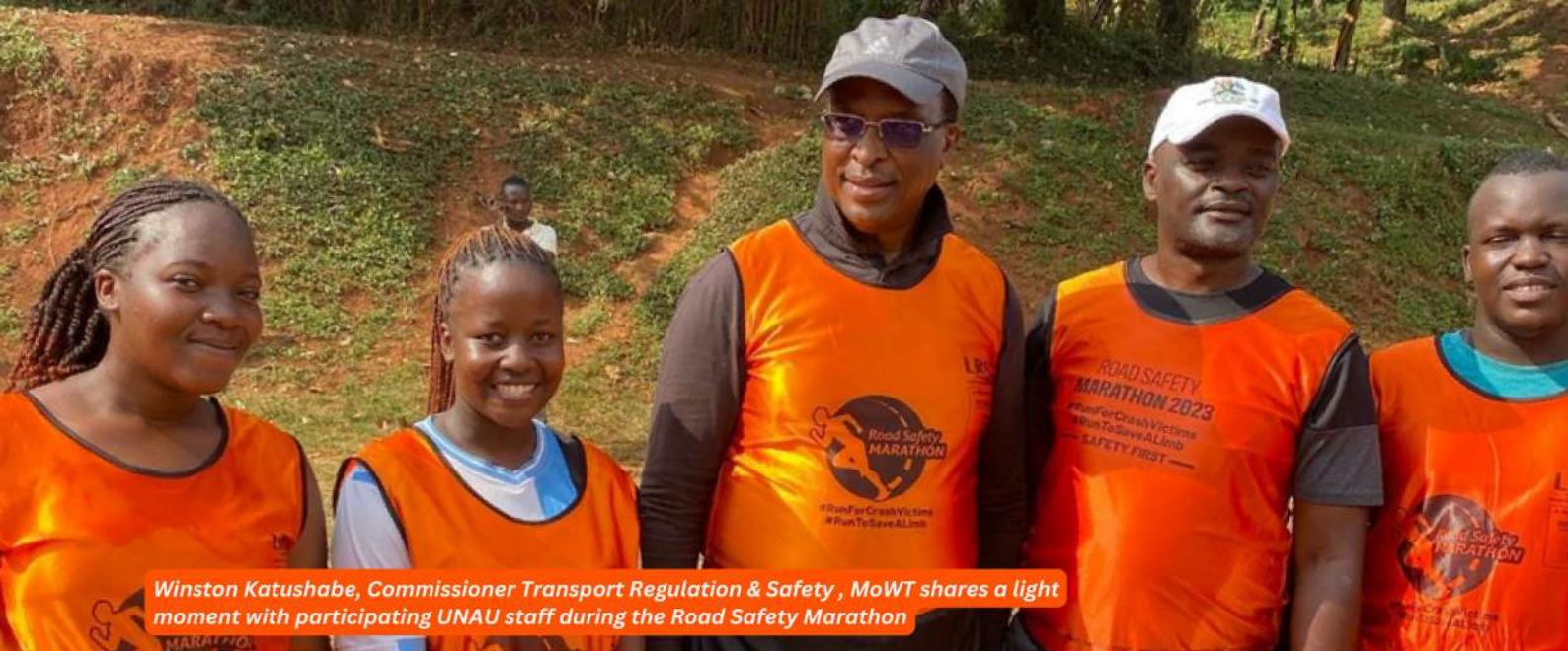
Winston Katushabe, Commissioner Transport Regulation & Safety, MoWT shares a light moment with participating UNA staff during the Road Safety Marathon