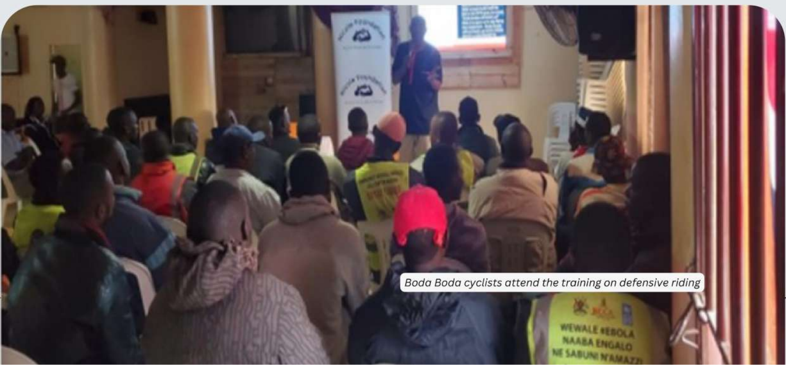
Boda Boda cyclists attend the training on defensive riding

To learn more and stand united for safer roads, visit the Nicole Foundation's website: www.nicolefoundation.org .