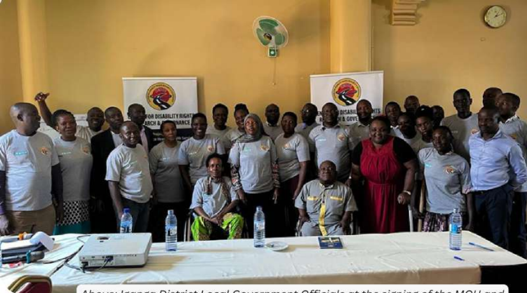
Above: Iganga District Local Government Officials at the signing of the MOU and inception meeting. Right: Participants attend the training on road crashes as major causes of spinal injuries in Uganda