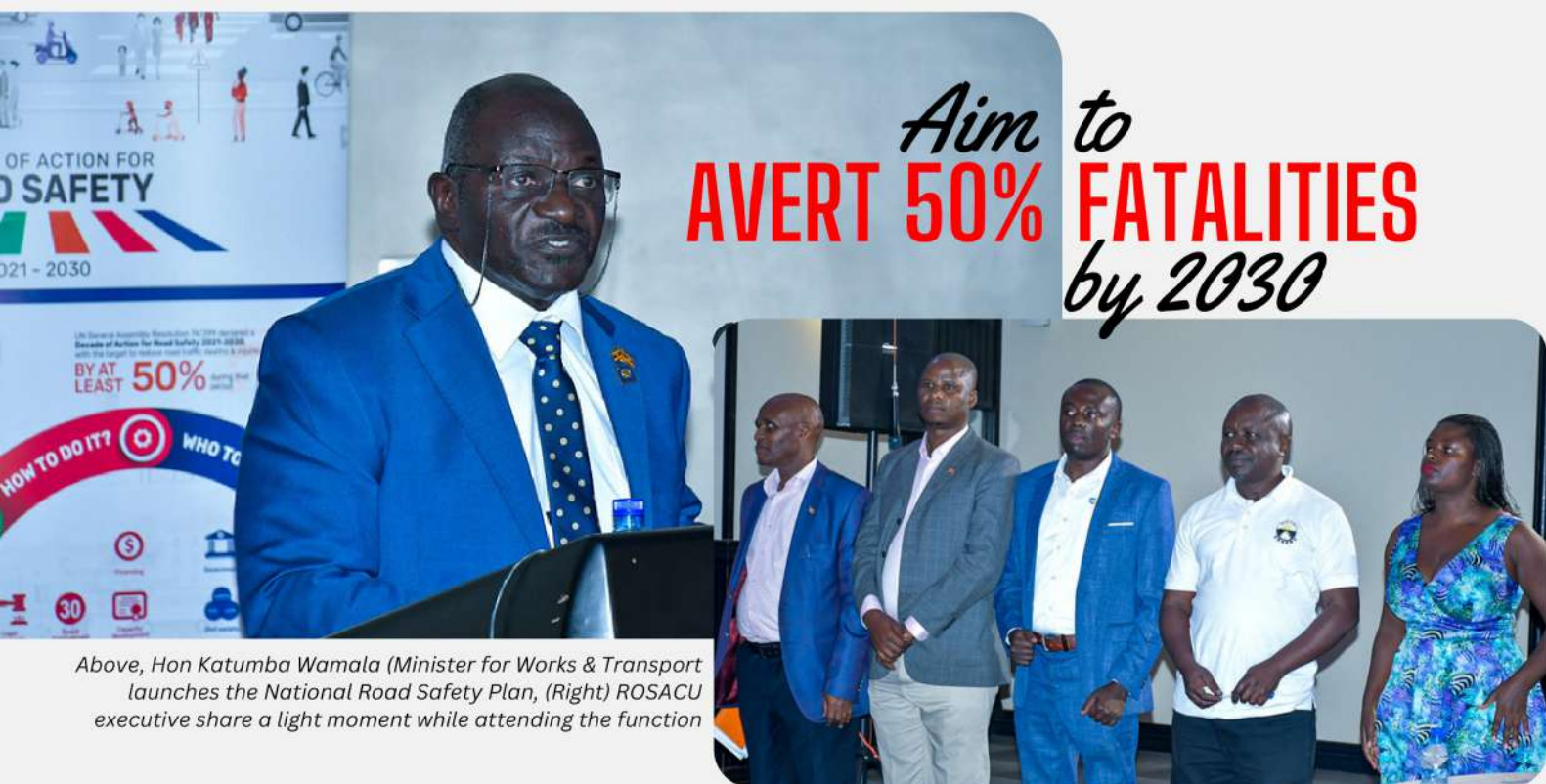
Above, Hon Katumba Wamala (Minister for Works & Transport) launches the National Road Safety Plan, (Right) ROSACU executive share a light moment while attending the function