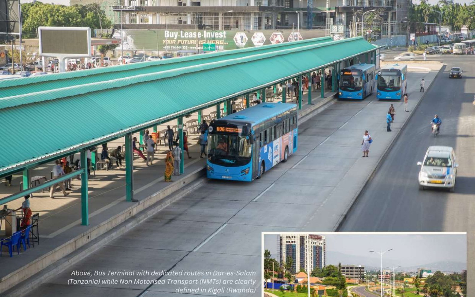
Above, Bus Terminal with dedicated routes in Dar-es-Salaam (Tanzania) while Non Motorised Transport (NMTs) are clearly defined in Kigali (Rwanda)